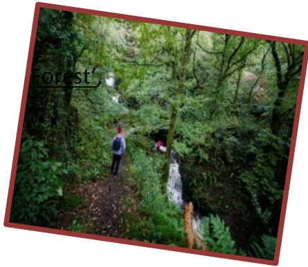
forest, fungi, bats

ensure the safety of players and spectators in terms of social distancing measures due to Covid19 restrictions.